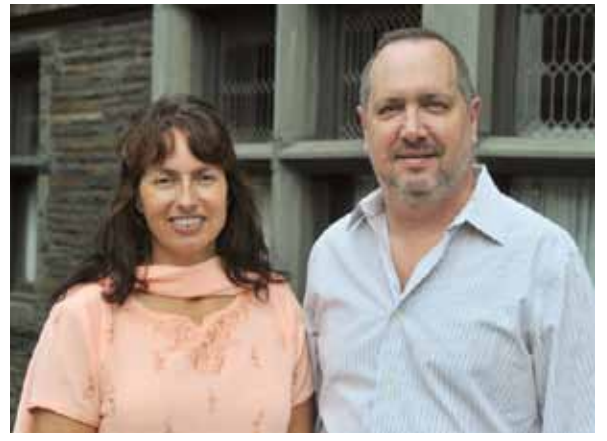
"The fellowship stimulated new ideas and will likely foster future collaborations."