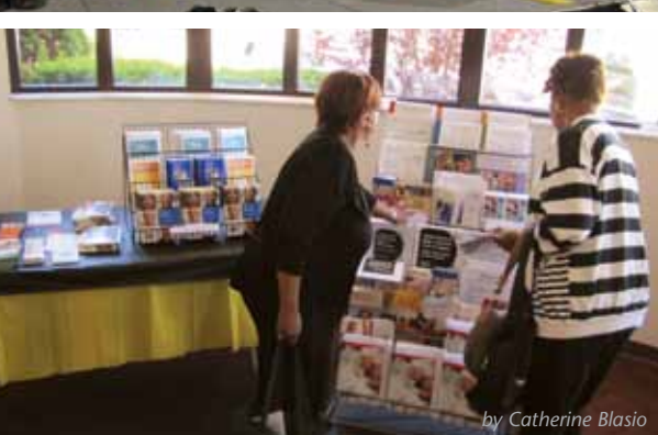
Clockwise from left: Guests complete a survey to volunteer for the HBEC research pool. Panelists discuss diabetes and heart disease. A new Resource Center full of quality literature on dozens of topics proved popular with seniors.