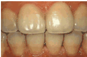
1 Strange Trick To KILL Teeth Stains