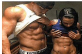
Weird Fruit KILLS Belly Fat