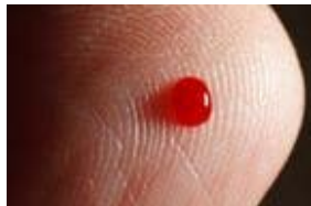
New Breakthrough For Diabetes